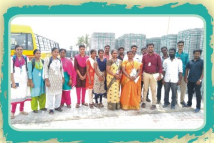
BHARATH PAVERS, Madurai, 16.10.2019 (2018-2020) PG & ( 2019-2021)PG